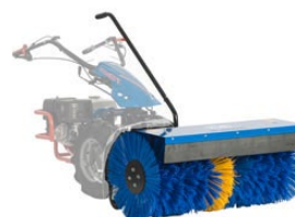
6. BCS Walk Behind (Larger installs)