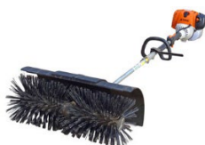
5. Power Broom