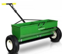
1. Drop Spreader