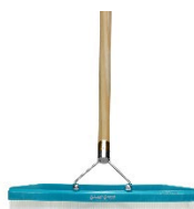
2. Grandi Groom